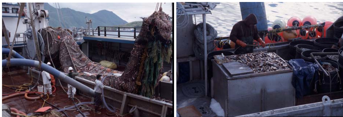
Fig. 9.1. Commercial fisheries interests in the Aleutians. Left: Unloading a haul of Pollock at Dutch Harbor. Right: Aleut fishing co-op at Atka, preparing bait for Halibut long-lining.

In this chapter we discuss our overall strategy for selecting species and radionuclides for analysis to meet our goals listed above (fig 8.1), and the specific considerations that were used to select species and radionuclides for analysis. Thus, this chapter first discusses our overall radionuclide analysis approach, then discusses in detail the selection of species for analysis and then the selection of radionuclides for analysis within the over all approach.